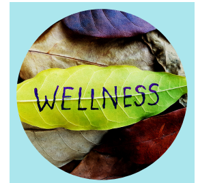
Virtual Wellness Center