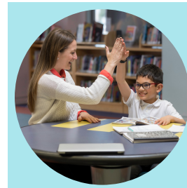
Mental Health Intern Program